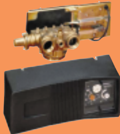
180 / 440i