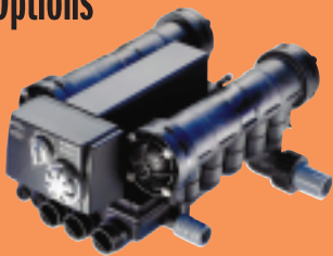
Magnum / 942F