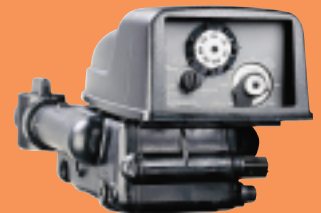
Performa / 440i