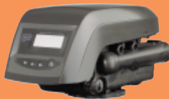
Performa / 740