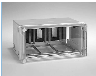
Triple Housing for Panel-Mounting

Dimensions (W x H x D): 360 x 266 x 235 mm Weight: 2.8 kg Type of protection: IP 66