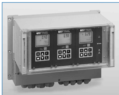
MFA Housing with MFA-Cl 2 , MFA-pH, MFA-Redox Analysers and MF485 Interface Module