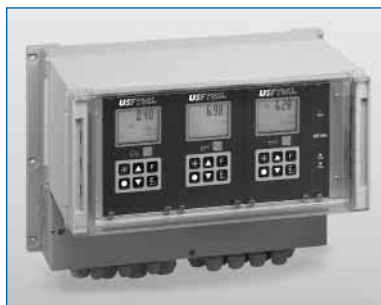
MFA Housing with MFA Cl 2 , MFA pH, MFA Redox Analysers and MF485 Interface Module